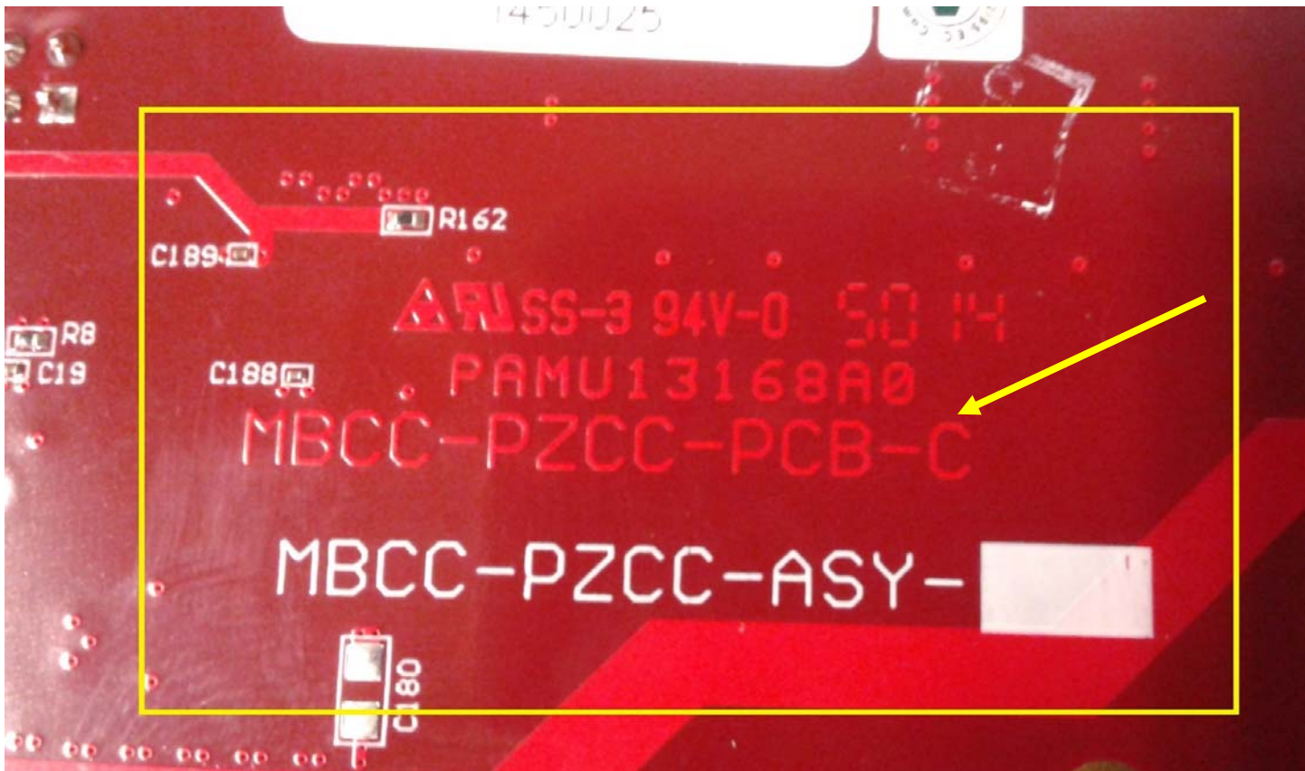
Figure 1 – Identifying PicoZed Carrier Board Revision

The Revision C PicoZed Carrier boards affected by these errata can be identified by the Revision of the PicoZed Carrier in the kit. The Revision of the PicoZed Carrier can be found on the backside inlay MBCC-PZCC-PCB-C as shown below: