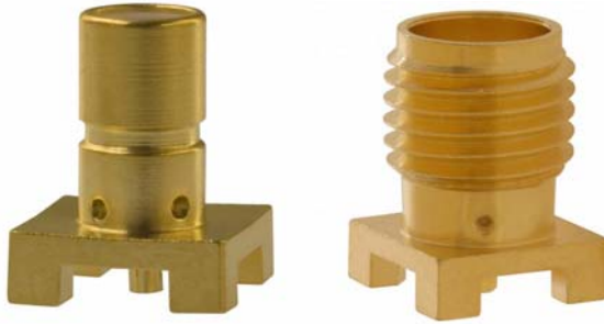
Figure 3 – SMB Connector vs SMA Connector

Located at position J15, J16, J19, J20, J21, J22, you will notice that instead of SMA connectors SMB style has been installed. While measures are in place to minimize manufacturing defects, there exists the possibility of the wrong part being placed. In this case, the SMA connector called out in the bill of material has not been placed.