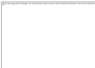
Figure 3 – QSPI Boot Mode

You may also program the quad SPI FLASH with the v1.1 software by utilizing the Open Source Linux In System QSPI Programming Tutorial posted at www.microzed.org/design/1519/10 . After programming, be sure to switch back to QSPI mode to see the results.