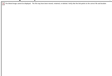
Figure 2 – SD Card Boot Mode

If your Revision F MicroZed Ethernet LEDs are constantly on, download the MicroZed_Linux_sd_image_v1_1_131212.zip file from www.microzed.org/documentation/1519 and install it on your microSD card. Change the MODE jumpers to SD card boot, then reboot the board.