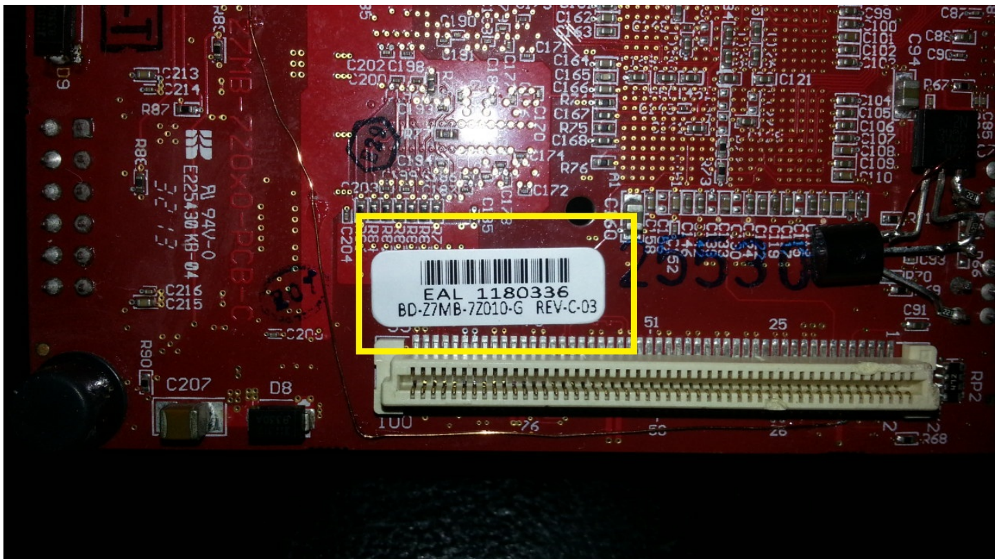
Figure 1 – Identifying MicroZed Board Revision

The Revision of the MicroZed Revision C and F boards can be found on the backside sticker as shown below. If you do not have a backside revision sticker, the MicroZed is a Revision B.